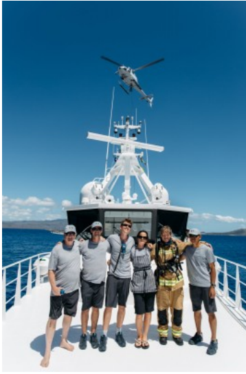
Big yachts help little islands after Cyclone Pam in Vanuatu

© 2015 The Triton. All rights reserved. Web site design and management by Connell Communications .