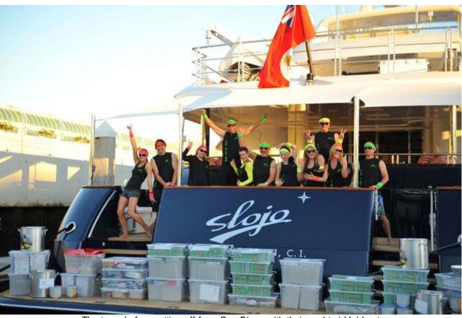
The team before setting off from San Diego with their yacht aid laid out